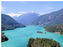
8 Must See Vacation Spots. This is where...