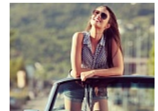
Become more successful by doing