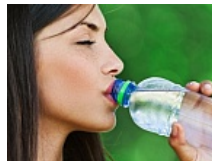
These 12 foods help to fight weight gain....