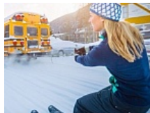
These photos are so amazing its hard